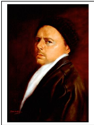
Portrait painting by June Holloway